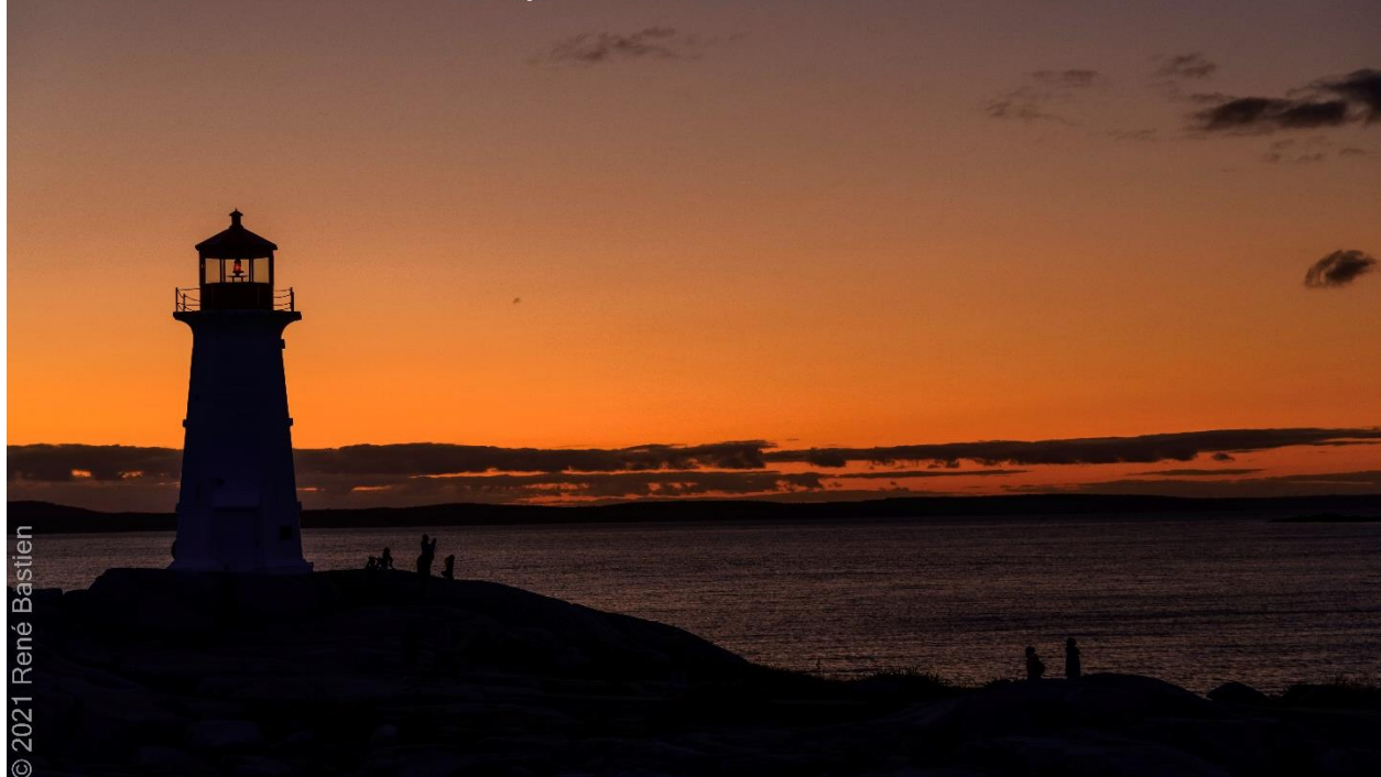
Peggy's Cove Lighthouse