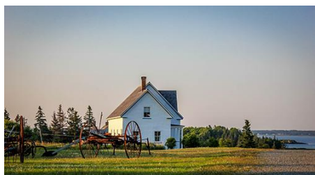
Historical Acadian Village-Uncredited