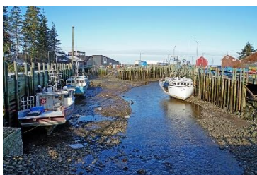
Halls Harbour Low Tide-uncredited

We will make our way back to Halifax, stopping on the way to experience the Bay of Fundy's tides firsthand.