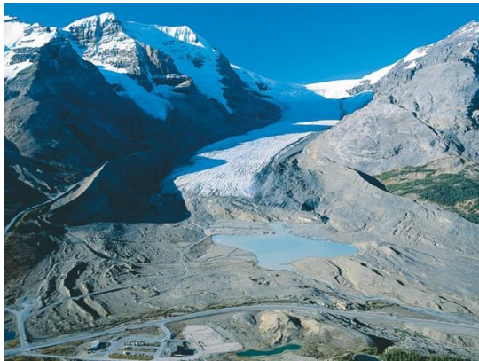
Columbia Icefield